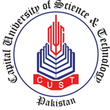
Capital University of Science & Technology (CUST), Pakistan