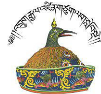
Royal University of Bhutan (RUB), Bhutan